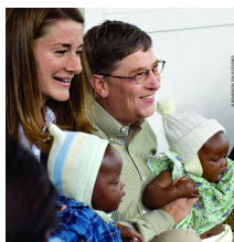
Melinda and Bill Gates

"Rotary has proven how much can be accomplished when a group selflessly uses every ounce of the political capital it has to help the world's most disenfranchised children."